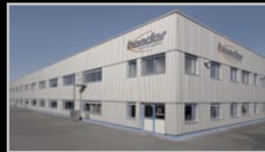
Claus Bender Werkzeugbau GmbH & Co. KG